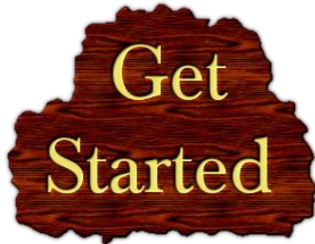
Image if you will. You are driving home sitting in traffic mindlessly staring at the traffic in front of you...